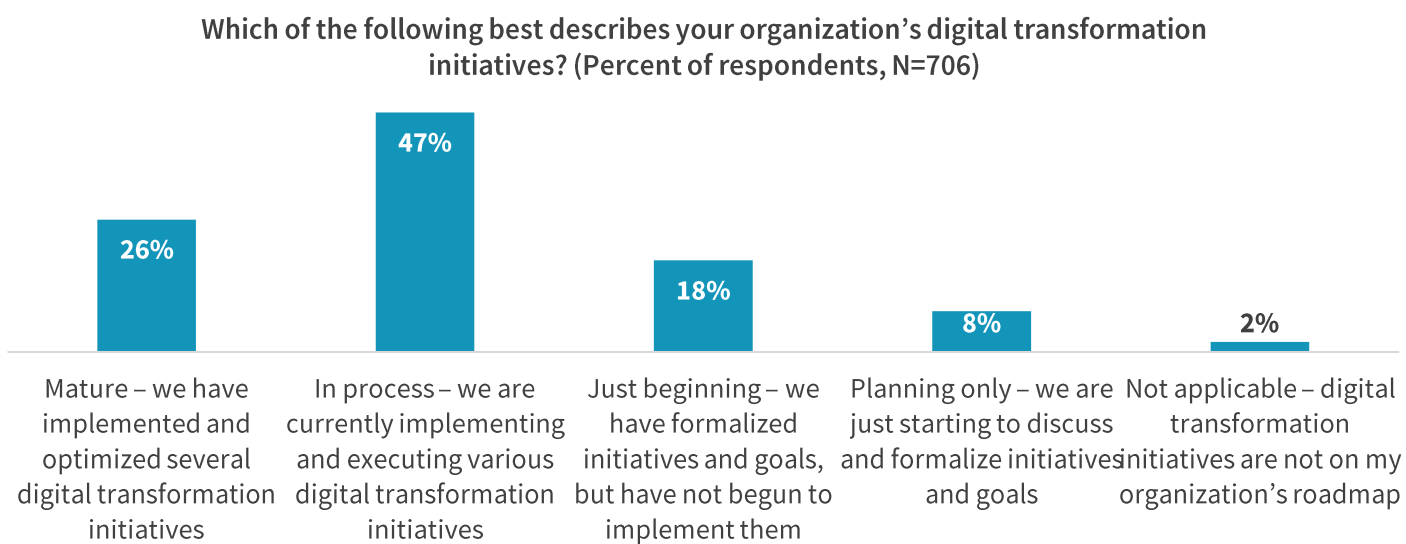
Figure 1. Digital Transformation Driving Modern IT Environments